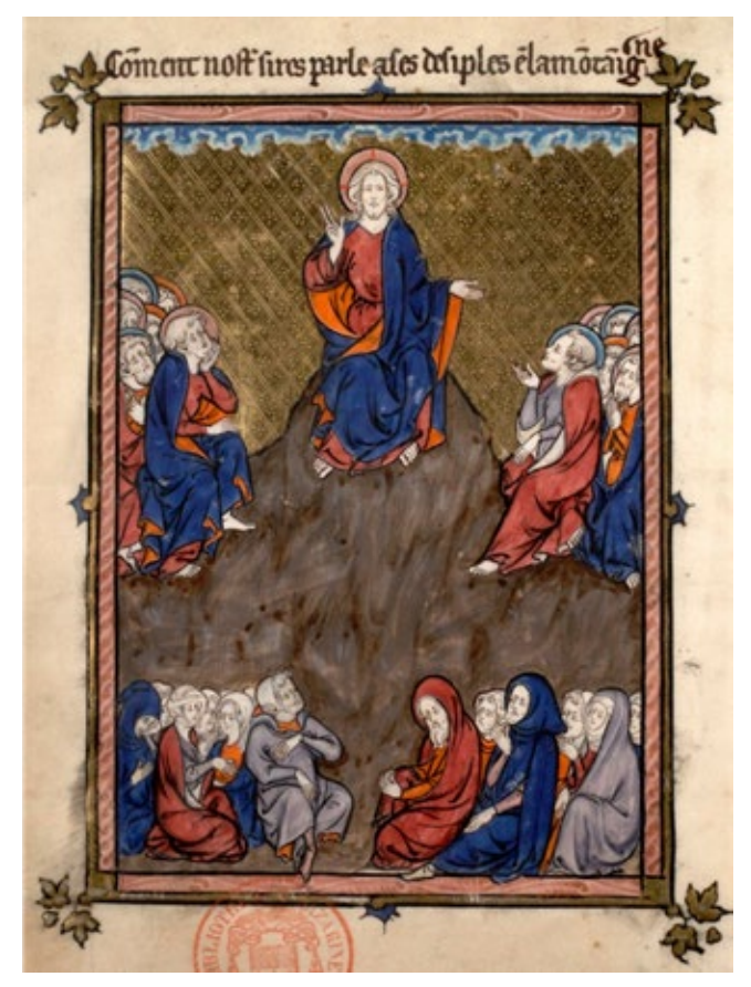
The Sermon on the Mount (13th century illumination)

the world? To rejoice in what is good, in what is beautiful and good, in what speaks to me of the Kingdom on the move... and to become aware of the suffering experienced, of the injustices, of the road still to be travelled?